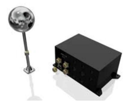
Fig. 4. Electric potential measurement equipment, project "Resonance"

A 3D model of sensing element and data logger used in project "Resonance" is shown in Fig. 4. The model is created in Autodesk Inventor IDE v.2018, [8]. The AD7656 used in the current study is an essential part of the corresponding control and measuring equipment.